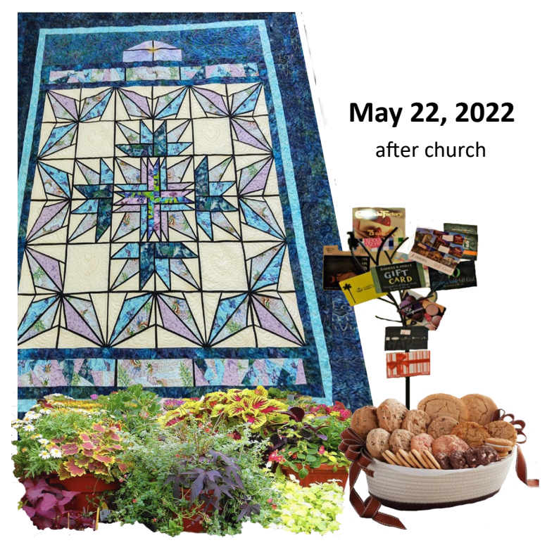
Quilt Raffle, Gift Card Tree Raffle

A Temecula United Methodist Women Fundraiser